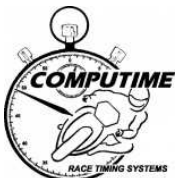
Clerk of Course - Alistair Kinsella